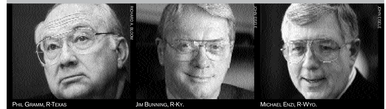
PHIL GRAMM, R-TEXAS